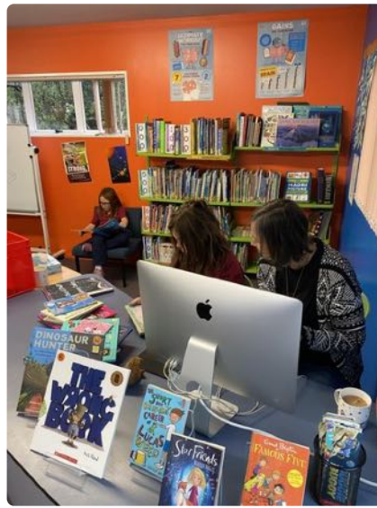
Isla issuing books